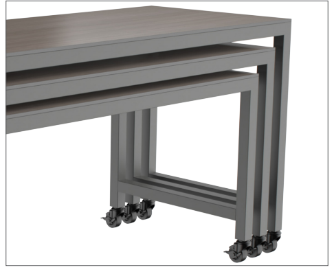
2. Tables nest for convenient storage and may be staged as furniture in public space when not in use