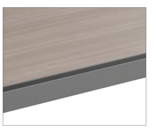
1. The durable table top allows for higher impact and features scratch, abrasion, and moisture resistance