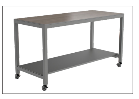
An optional shelf for each table will facilitate additional F&B storage adding value to action stations and buffets