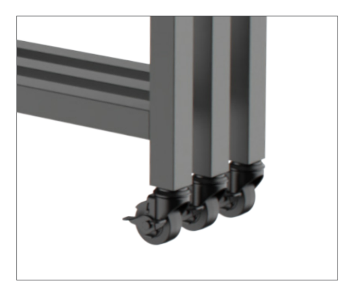
3. Durable casters allow for ease in transporting EVO and are equipped with locks to ensure stationary stability