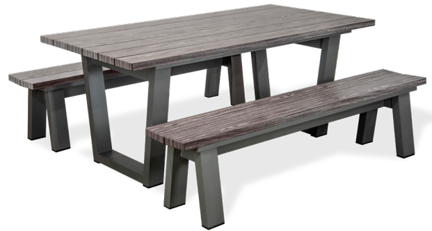
Table Model # VD3672T30 Bench Model # VB1272