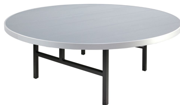
Model #: AL72RD Matte Silver Finish w/ Black legs