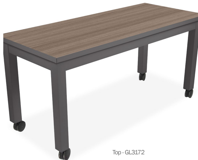
Top - GL3172