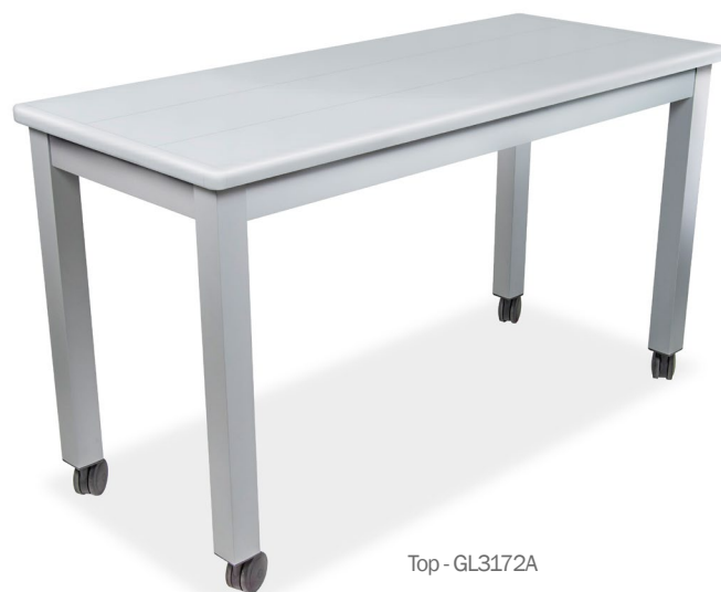
Top - GL3172A