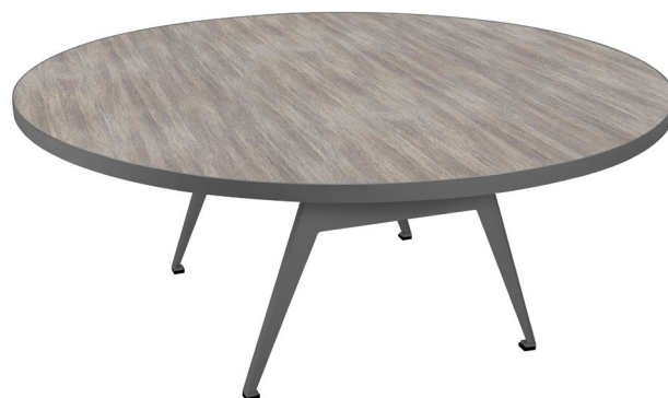
Model #: DS72RDAL Weathered Fiberwood Laminate w/ Iron legs & perimeter