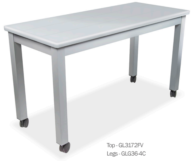
Top - GL3172FV Legs - GLG36-4C