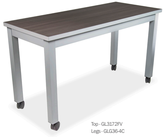
Top - GL3172FV Legs - GLG36-4C