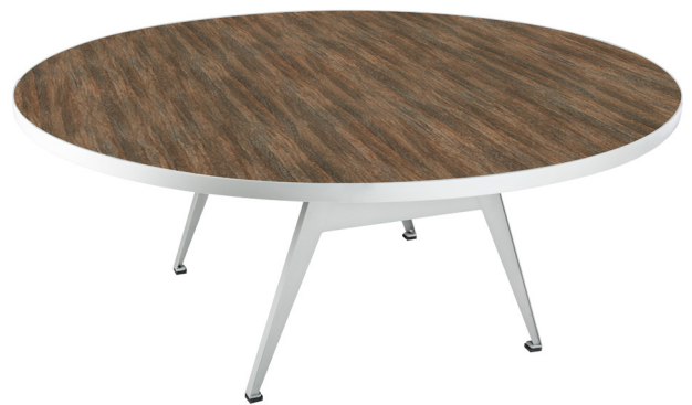
Model #: D72SRFVAL Weathered Fiberwood Laminate w/ Silver legs & perimeter