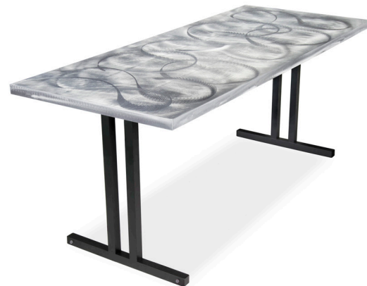
Model #: SA3072P Satin Swirl Finish w/ Black legs