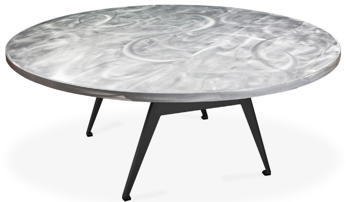
Model #: SA72RP Satin Swirl Finish w/ Black legs