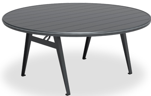
Model # O60RVAL Pebble Finish