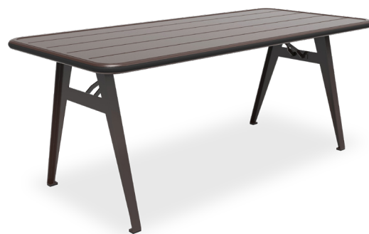
Model # O3072V30HAL Carob Finish