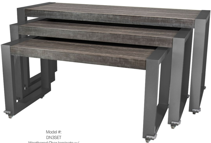
Model #: DN3SET Weathered Char laminate w/ Iron legs