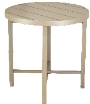
Model #: x030R-30HXBSQ Dune