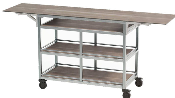
Bleached Legno Laminate Brushed Stainless Steel Frame