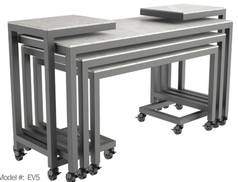
Model #: EV5