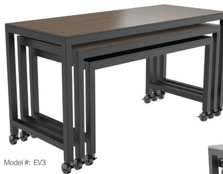
Model #: EV3