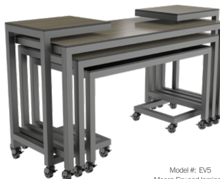
Model #: EV5 Mocca Firwood laminate Iron powder coating