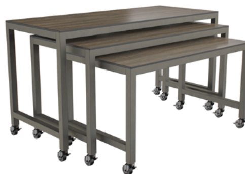
Model #: EV3 Walnut Fiberwood laminate Slate powder coating

*Ganging accommodates large, medium, & small tables