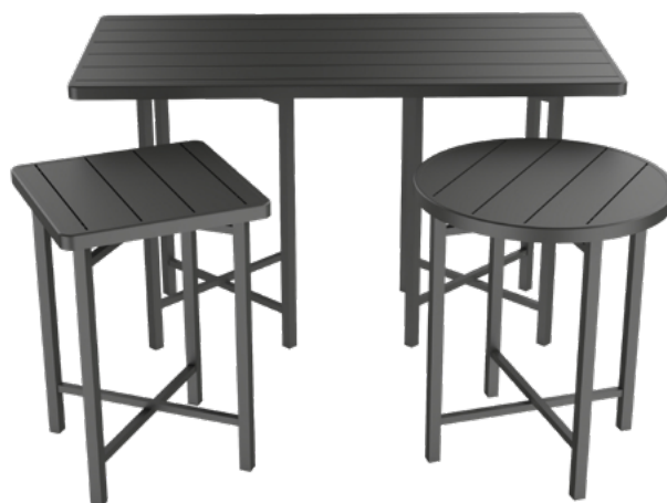
Model #: X02424-36HXBSQ Pebble powder coating