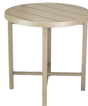
Model #: X030RD-30TOXSB Dune